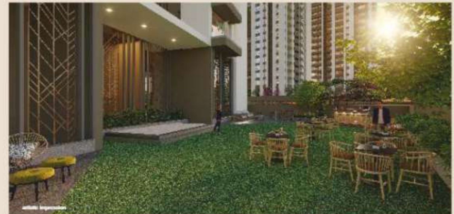
PARTY LAWN AREA