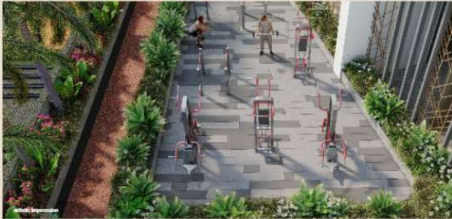
OPEN AIR GYM