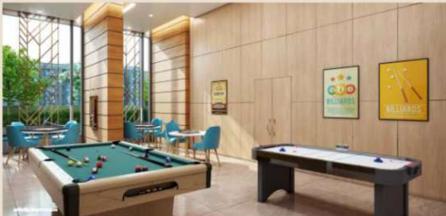
INDOOR GAMES AREA