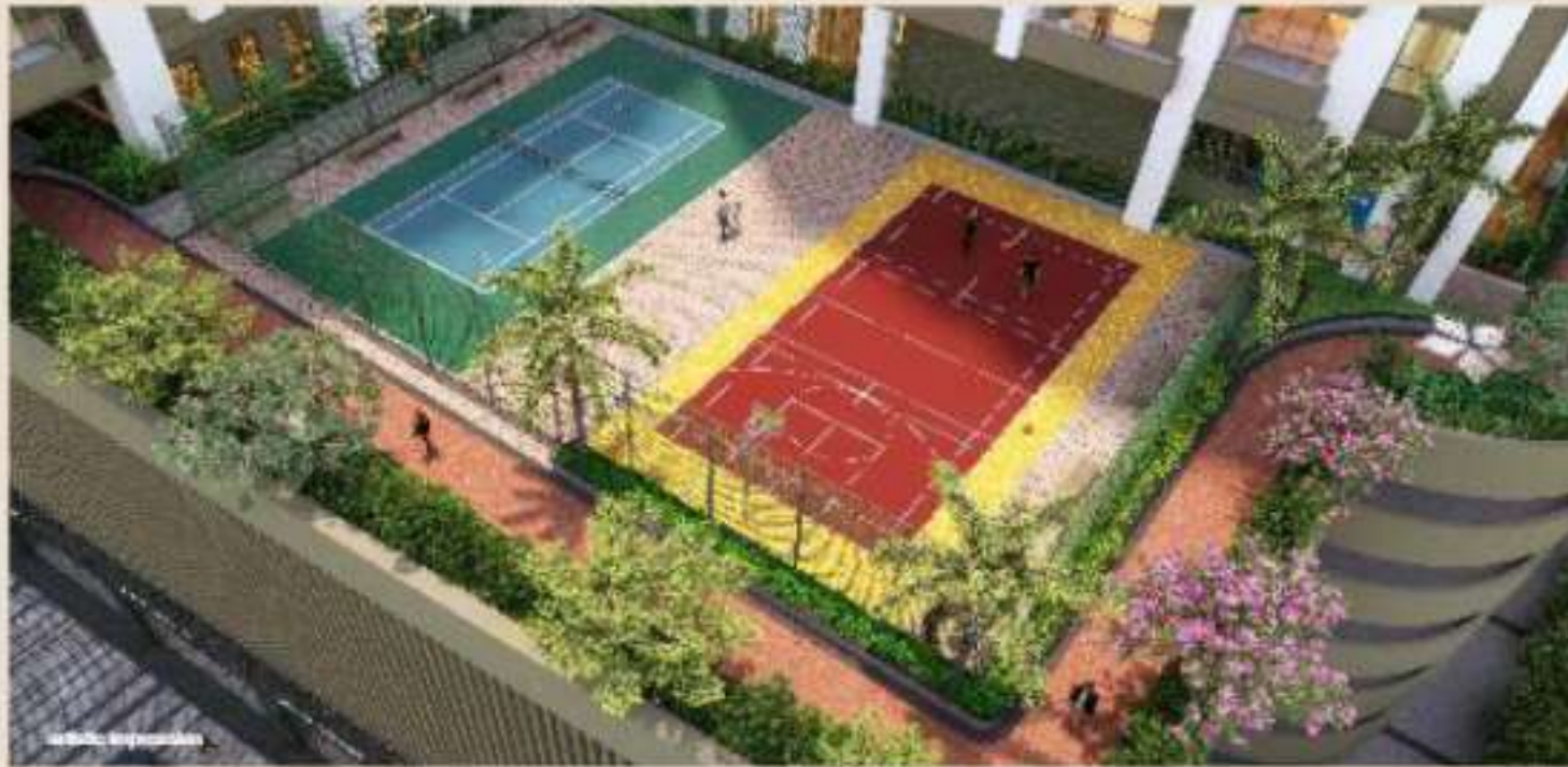
OUTDOOR GAMES AREA